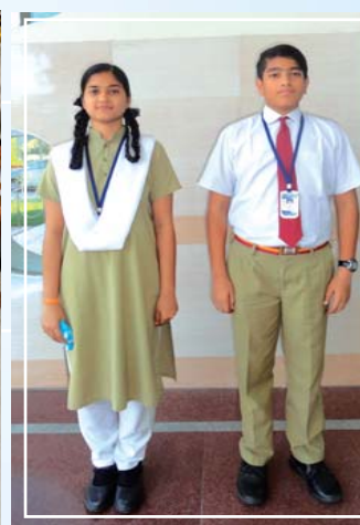
Uniform for Classes VI to XII