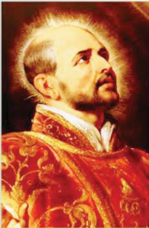
St. Ignatius of Loyola (1491 - 1556) Founder of Society of Jesus

“Vision without Action is merely a dream Action without Vision just passes the time Vision with Action can change the World”