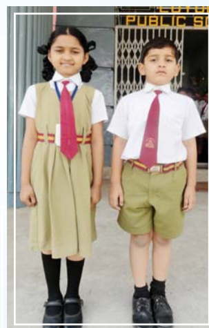
Uniform for Classes I to V