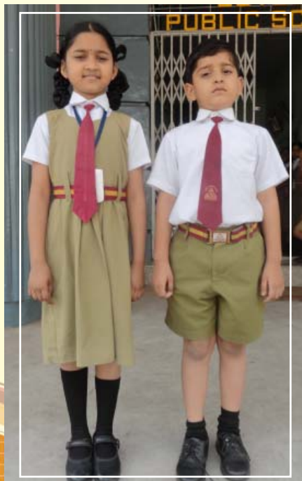
Uniform for Classes I to V