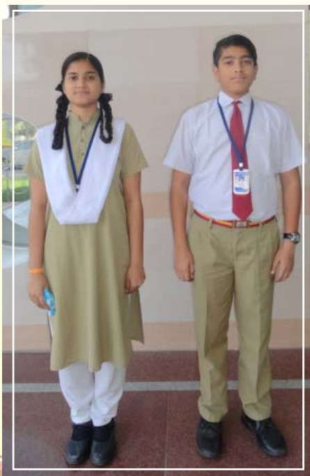
Uniform for Classes VI to X