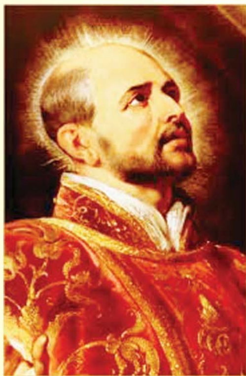
St. Ignatius of Loyola (1491 - 1556)